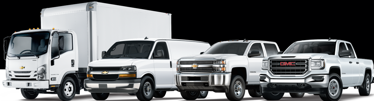
2018 Chevrolet Low Cab Forward 3500HD