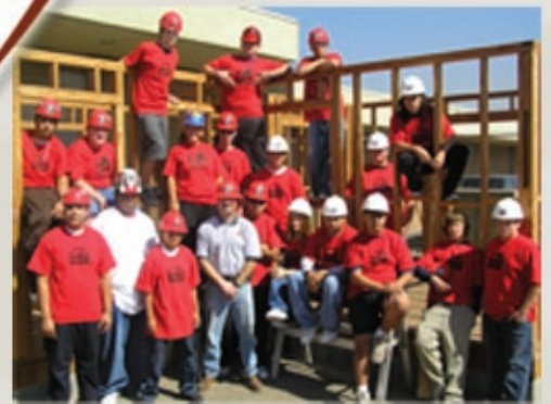
BIA/OC's Building Industry Technology Academy (BITA), helps high school students prepare for the future with a comprehensive construction curriculum.

Tickets $100 per person – all inclusive of food and drink, as well as a chance to win amazing door prizes such as gift certificates to local restaurants, kitchen and home décor, spa and hotel packages.